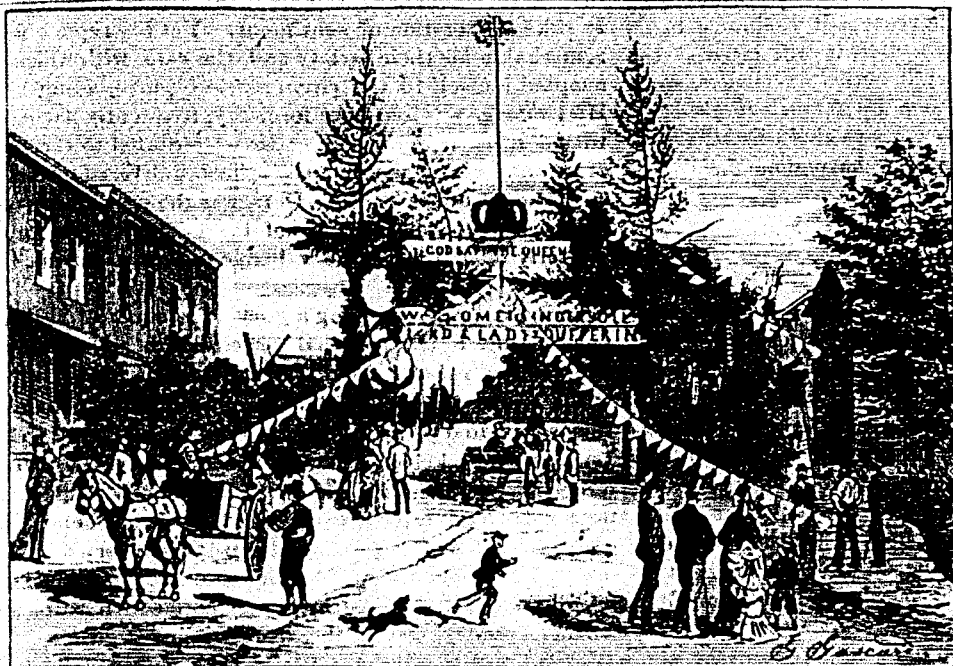
BATTERSBY'S ARCH: AGRICULTURAL IMPLEMENTS.

SINGLE COPIES, TEN CENTS. $4 PER YEAR IN ADVANCE.