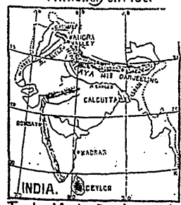
Trade Mark Registered