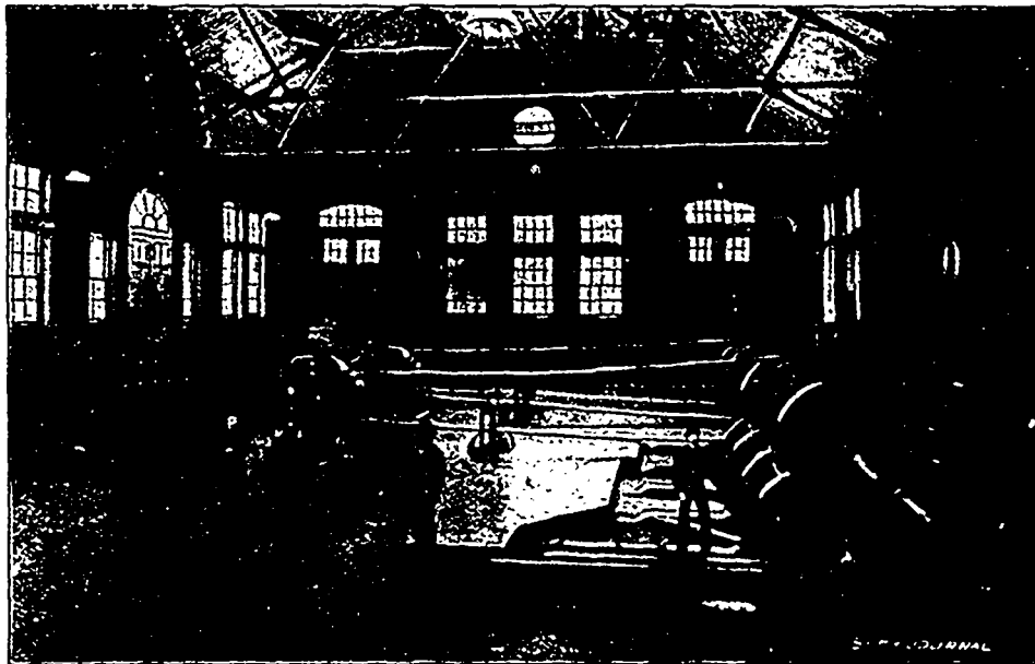
NIAGARA FALLS PARK AND RIVER RAILWAY—INTERIOR OF LOWER HOUSE.

embodied in the annals of the association as marking an historic epoch in the advancement of the science of electricity as applied to industry and it is therefore with more than ordinary satisfaction that I am authorized to state that at no previous period has this association been as prosperous, shown greater vitality, or commanded such respect. It is now an acknowledged authority on matters electrical, its membership confers a privilege that has more than a sentimental value, and its gathering strength will offer a bar to use of powers municipal or corporate unjustly or arbitrarily directed for the purpose of destroying