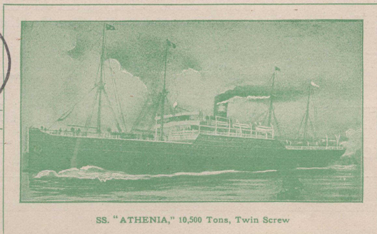
SS. "ATHENIA," 10,500 Tons, Twin Screw