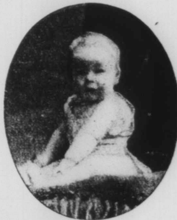
Raised on It.

Frank Magor & Co., - 403 St. Paul St., Montreal Agents for the Dominion