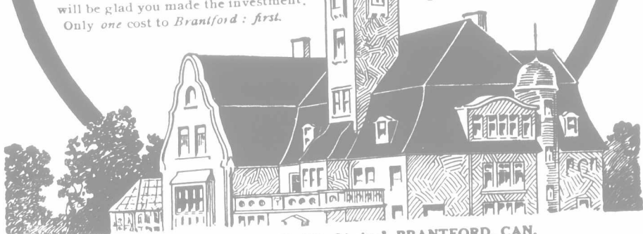
BRANTFORD ROOFING, CO., Limited, BRANTFORD, CAN.

It needs no repairs, and anyone can lay it in any weather. Big Roofing Book, with samples, free from dealer or us. Brantford Asphalt Roofing, Nos. 1, 2, 3. Brantford Rubber Roofing, Nos. 1, 2, 3. Brantford Crystal Roofing, one grade only, (heavy). Mohawk Roofing, one grade only.