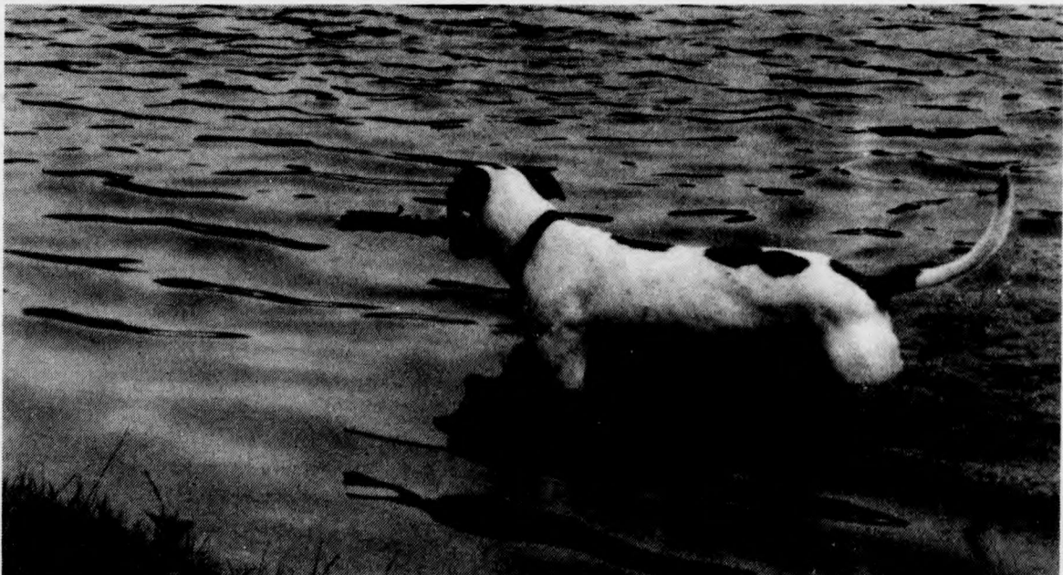
RUSTY THE TRUSTY FISHDOG: Excal's superconscious fisher people may not have realized it at the time but that dog who was "agitating the prey" was actually luring those goldfish to the surface through hypnotic suggestion learned at Reveen's side.

Although serious anglers may be crestfallen to learn of the poor table quality of this Stong Pond fish, on the bright side, despite its tendency to over-eat, the goldfish is a fairly respectable fish to have in the neighbourhood. Fortunately, the pond contains no pike-a creature whose mere mention sends blood rushing to the cheeks of real fishermen