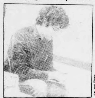
Hacker on tour."Thanks to Excal. for their financial support!"

Held outdoors in a beautiful park in the middle of the city, this festival is unique in both its programming and atmosphere. With several thousand people coming from all over Europe and camping right in the park, the