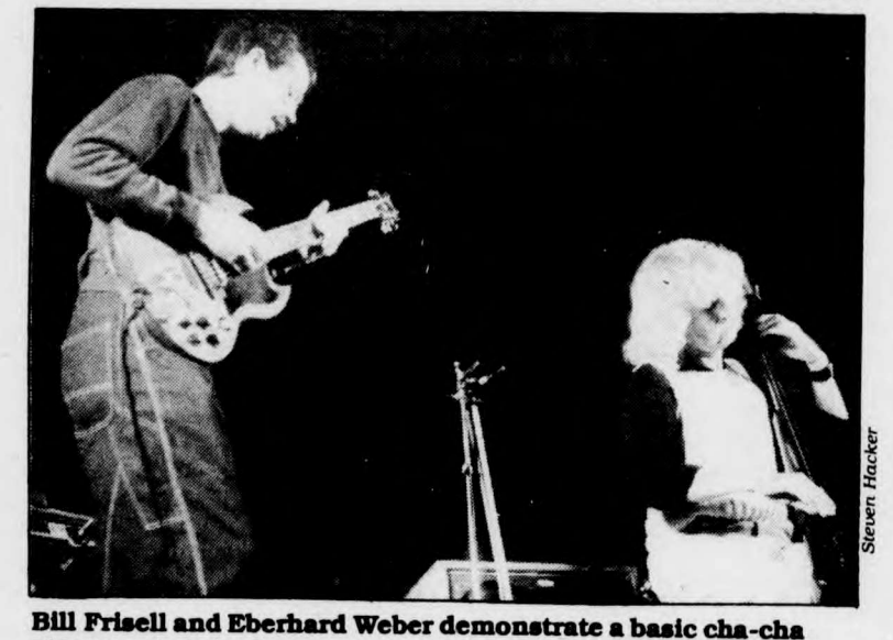
step on stage in Germany.

As good as they may seem on paper, jazz festivals are not always the best places to experience live music. The settings are often not as intimate as in the clubs - it's hard to develop a rapport between audience and artist in a large outdoor park, gymnasium. or tent. In addition, listening to live music for eight-or ten-hour periods can be very demanding and great performances often go unappreciated by music-weary listeners. However, for a jazzstarved backpacker wandering through Europe, it sure beats going to bed early in the youth