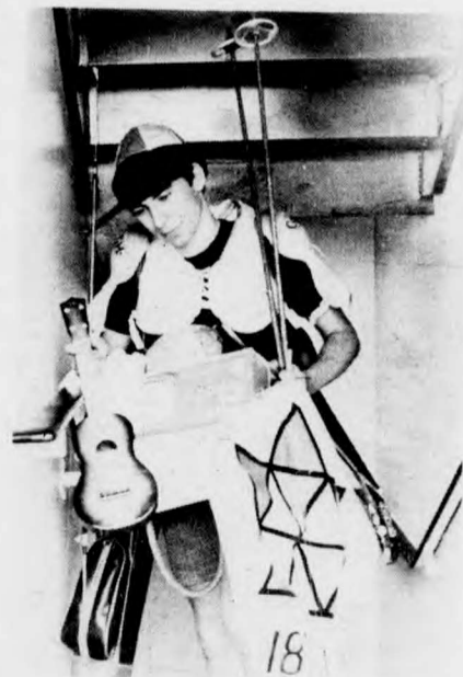
Ah yes! Welcome to University life.

Don't rush out and buy York jackets, rings, towels and earmuffs. Wait a while and you may be able to get them at reduced prices. And watch for the second hand bookstore.