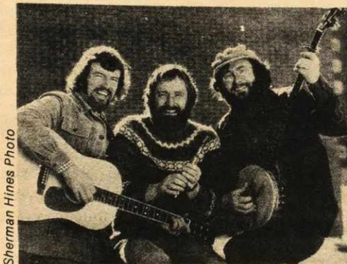
Ryan's Fancy will be at Dal Thurs. Nov. 2

Featuring Woodstock; with added attraction THE BEATLES AS THEY WERE, a documentary of the rise to success of the fabulous four. Complete with some of their best known tunes.