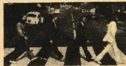
"The Beatles as They Were"

Advance tickets go on sale Monday, October 30 at 11:30 a.m. at the SUB INQUIRY DESK. AVOID DISAPPOINTMENT—BUY EARLY