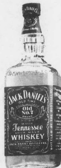
JACK DANIEL'S TENNESSEE WHISKEY