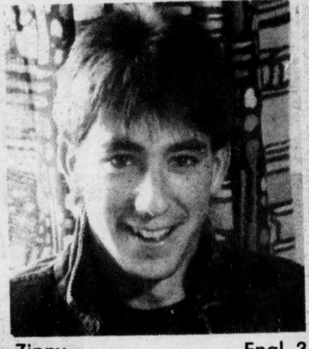
Zippy Engl. 3 More nude pictorials.