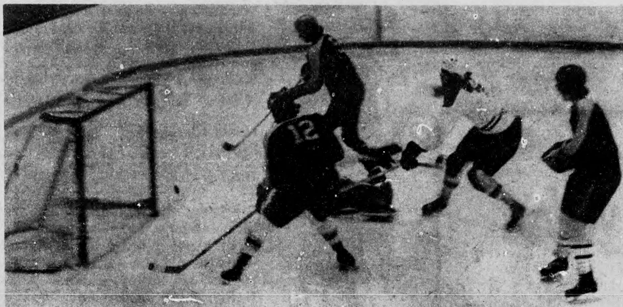
Action taken during men's Inter-Class Hockey League game in which Engineering 3 beat Business 3 by the score of 5 to 4.

The recently released secret documents do not make known many startling new facts. But they do provide an important overview of the federal government's manner of handling native demands for their rights. They also show that the cabinet very much wants to keep the native claims out of court so any negotiations that take place can be on the government's terms.