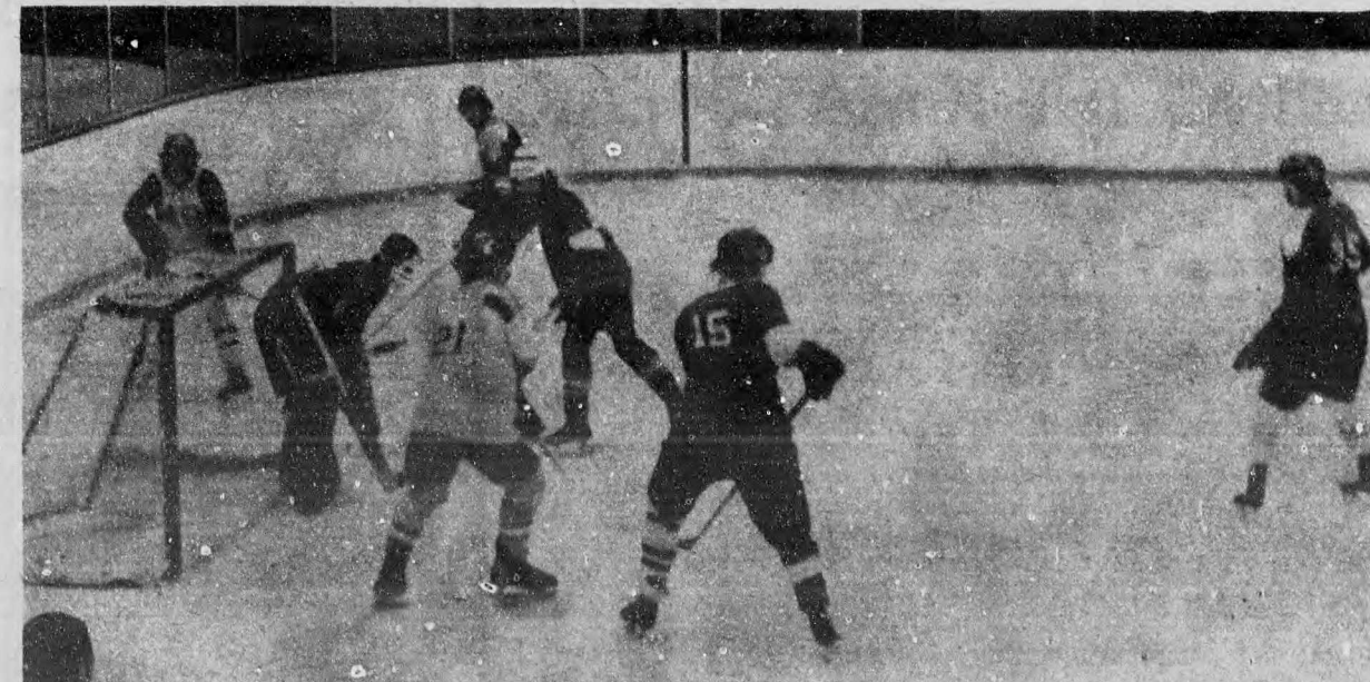
The photo was taken during an Inter-Residence Hockey League game played at the Lady Beaverbrook Rink. The "animals" of Aitken somehow are in first place in the league standings.