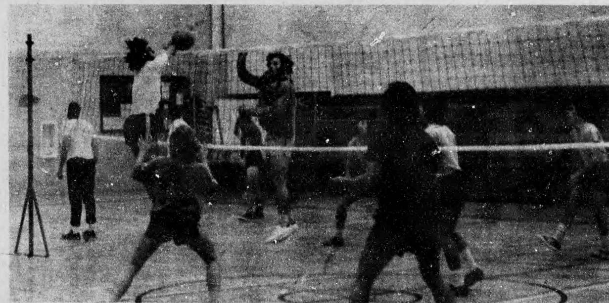
Inter-Class Volleyball league games are played on Tuesday nights, and this is a typical game. The teams from physical education are dominating the league standings.