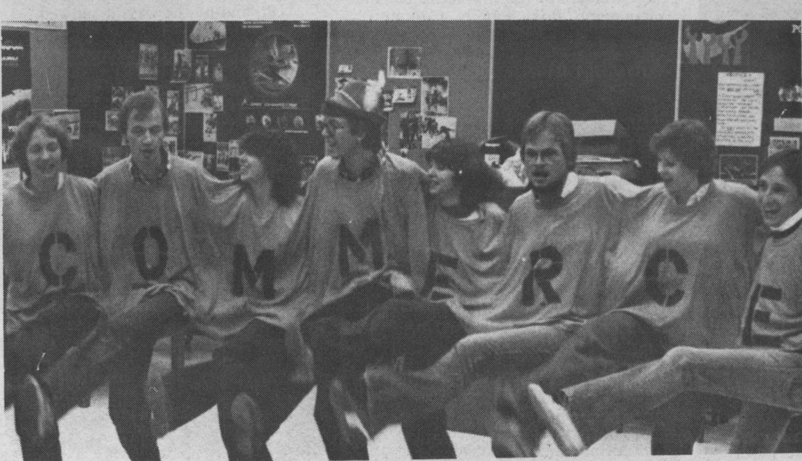
Looks like these Commerce students are grasping the concept of sharing the wealth!