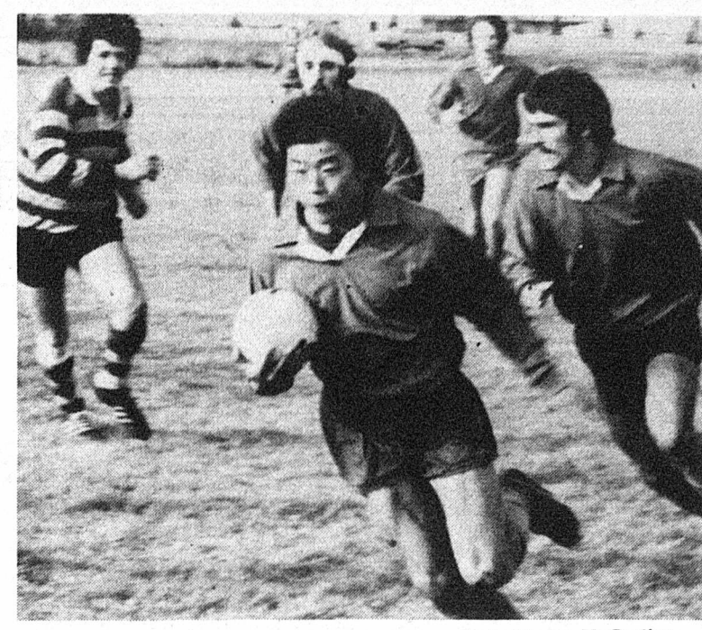
The Golden Bear rugby team came up short in the Can-West rugby championships held in Ellerslie over the weekend.

Saturday, U of A played ctoria and Calgary went ainst UBC. The Golden Bears yed their best game of the rnament, dropping a close 18decision. Victoria scored from opening kick-off when a