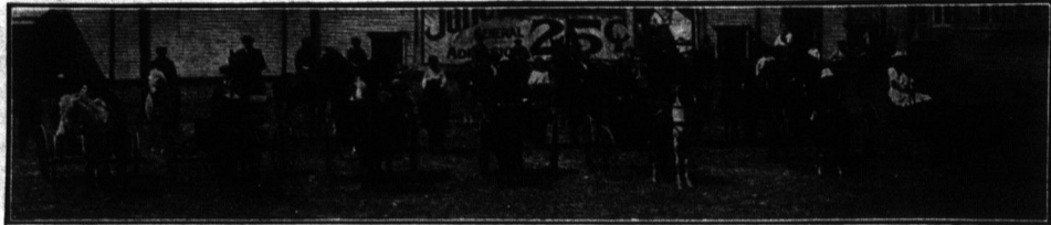
Ready for competition at the Winnipeg Horse Show

The poultry department of Purdue Agricultural College has produced an extraordinary hen, and poultry fanciers and those calculating entering the business of raising poultry might well devote some time to a consideration of the record established by her. Miss Purdue, for so the hen has been named, is a White Leghorn, and during the last two years has produced 443 eggs, weighing 41.5 pounds.