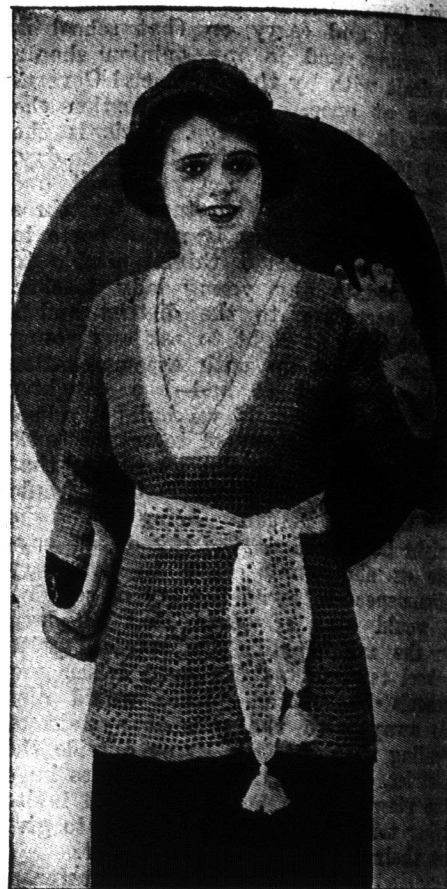
Slipover No. 2