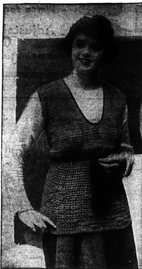
Sleeveless Coat No. 1

To decrease at beginning of row, slip stitch across the 1st mesh of row, work across row as usual, and to decrease at end of row work till within last mesh of previous row. Turn. Another way to decrease at beginning of row is ch. 3 and do 1 d.c. in d.c. of 2nd mesh, and at end of row by doing 1 d.c. in last mesh without doing any chain.