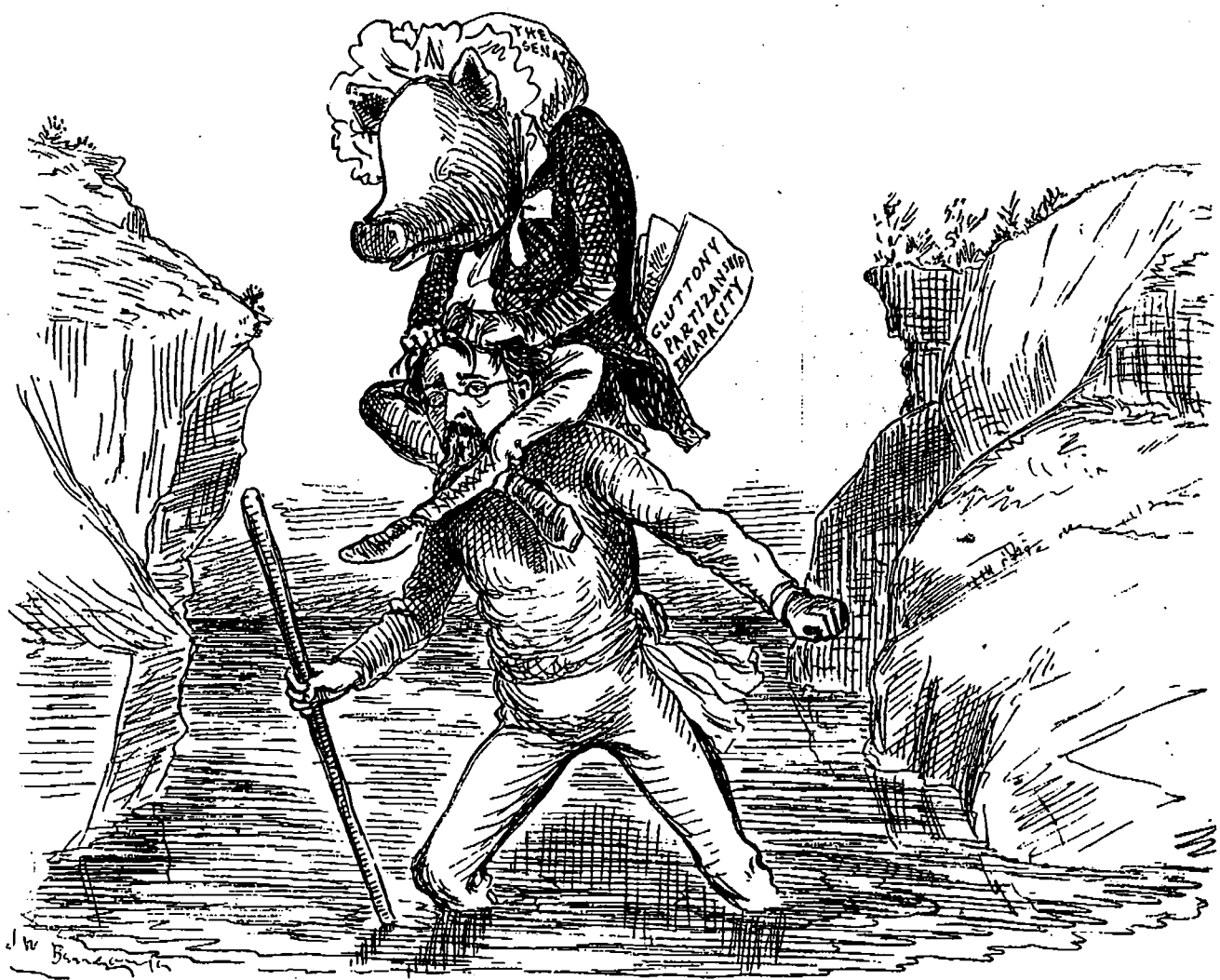
"THE SENATE MUST GO."

THE REMINGTON STANDARD TYPE-WRITER! —IS THE— Best Writing Machine in the World. AGENTS WANTED! AGENTS WANTED! Good Terms and Territory for live men. Shorthand writers preferred. THOS. BENGOUGH, GENERAL AGENT FOR ONTARIO, 29 KING ST. WEST, TORONTO. Bengough's Shorthand Bureau furnishes Shorthand help to Business men. Send for new Circular giving Testimonials in favor of Type-Writer, now in preparation