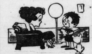
A Dreadful Possibility.