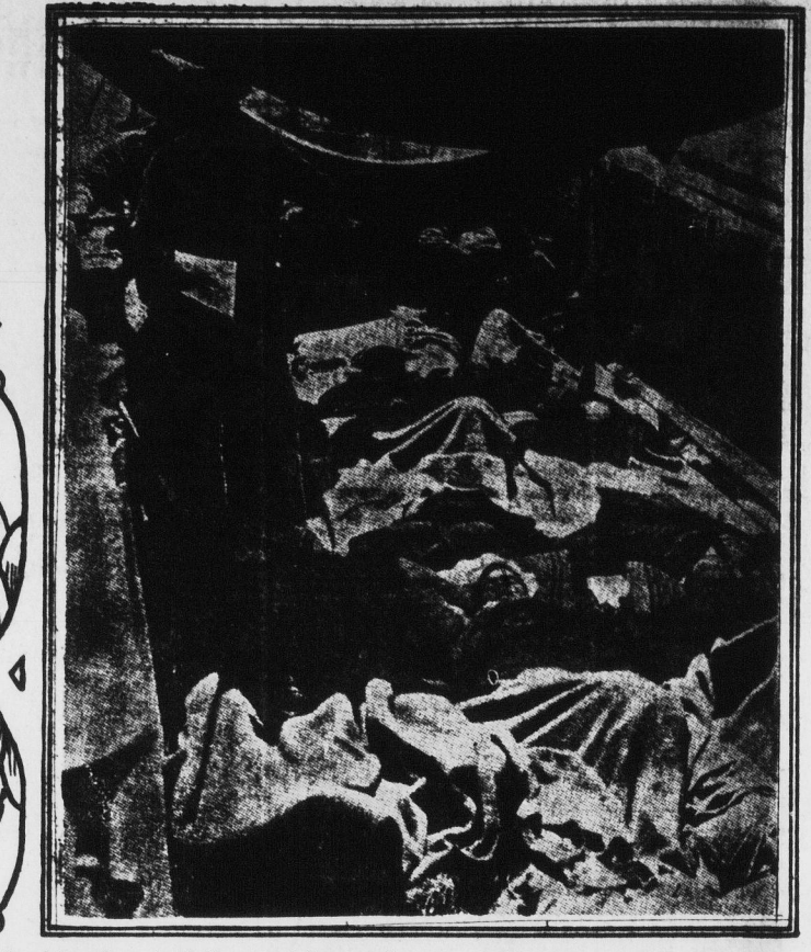
The picture shows Australian wounded on board a native craft on their way to a hospital ship. Awnings have

CARING FOR THE WOUNDED AT THE DARDANELLES