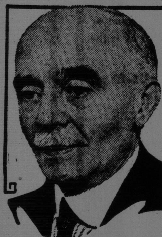
DR. S. J. CRUMBINE.

Keep the cow clean and wash your hands well before milking.