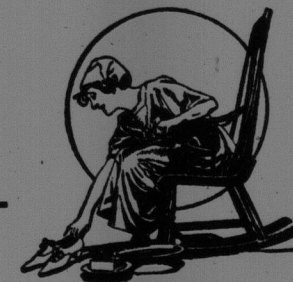
For White Shoes