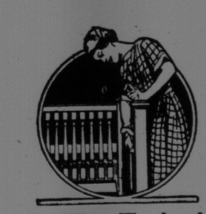
For White Woodwork