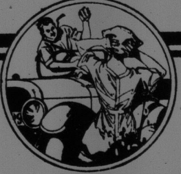
For Glass and Nickel