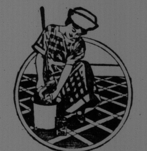
For Linoleum and Congoleum