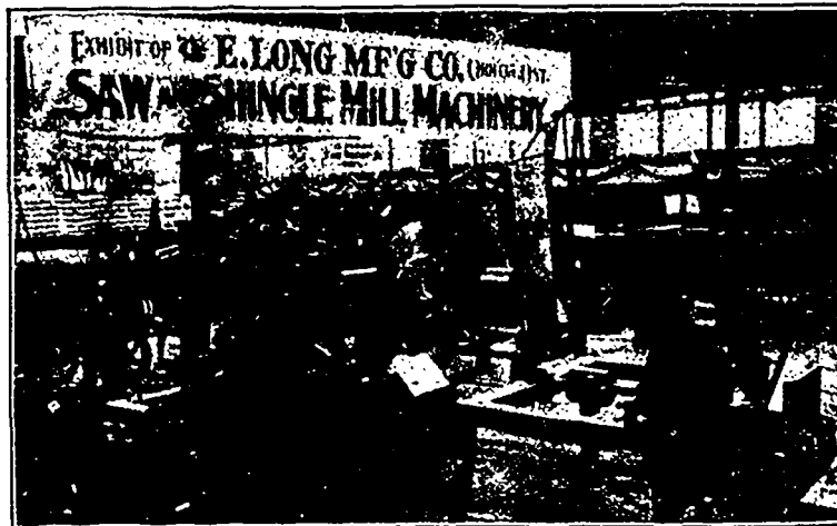
DOMINION EXHIBITION, WINNIPEG—EXHIBIT OF E. LONG MFG. COMPANY.