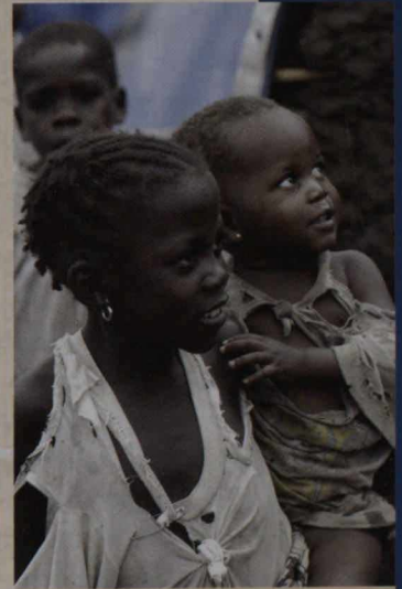
Bunia IDP camp, Ituri Province, Democratic Republic of the Congo