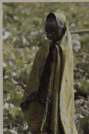
World Food Programme Food for Work, Kibungo, Rwanda