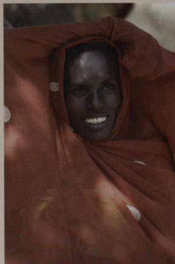
Zam Zam IDP camp, North Darfur, Sudan

See Ambassador Bob Fowler’s photographs at www.robertfowler.com .