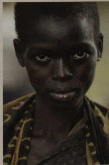
World Vision feeding station for AIDS victims, northern Uganda