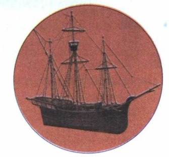
Model of the Matthew

As Asian societies transform themselves, there are tremendous opportunities to increase Canadian exports to the region and create jobs here at home. Canadian areas of strength, such as telecommunications, energy, agri-food, and environmental technologies match up very well with the sectors Asian economies are trying to improve. Asia Pacific's emerging middle class also has greater discretionary spending power for consumer goods, tourism, education and cultural industries.