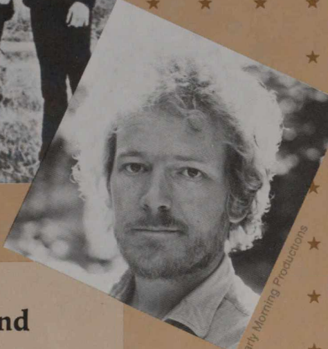
Early Morning Productions