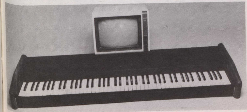
<sup>A</sup> new generation computer music instrument by Syntronics/542435 that offers reproduction of a full score on the video screen.

IVL Technologies' Pitchrider 2000 is a pitch identification device that instantly recognizes notes played by any musical instrument.