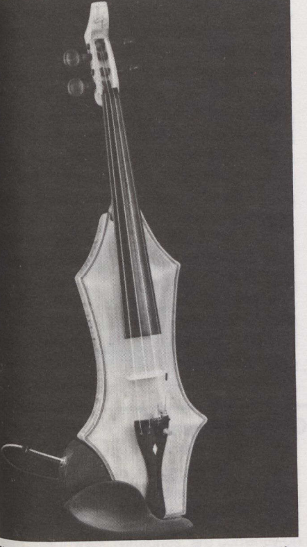
Electric violin from Raad Instruments is the first in the musical world to offer undistorted amplified acoustic violin sound.

Canada's musical products industry, renowned for its development of new and innovative quality equipment that is marketed both in the country and internationally, will be represented at MUSIKMESSE 85 in Frankfurt, Federal Republic of Germany, from February 9 to 13, 1985, by a number of firms offering a wide range of products.