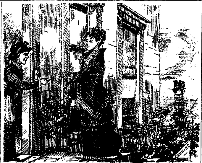
MURDER WILL OUT!

Female Patient.—If you please, Doctor, what can yer do for my eyes? Oi've got ulsters in them, and oi've tried every druggist store in the city for a rimidy!