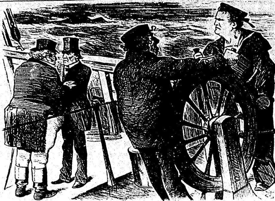
TOO "HARD A-PORTIE"!