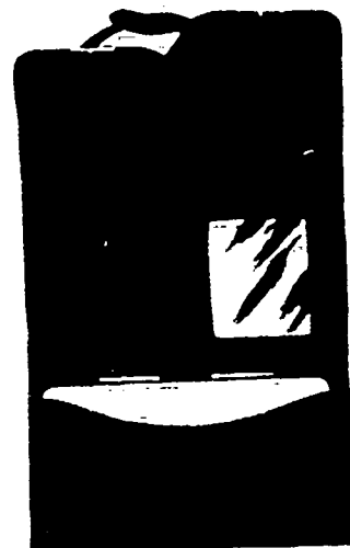
THE "VANITY" BAG-Open