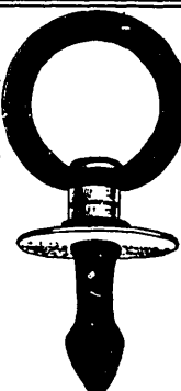
Fig. 30 In two sizes, Small and Large.