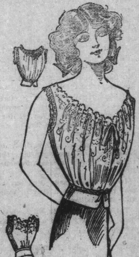
NEW CORSET COVER.

What is Doing in Hand Bag Fashions. Revived Fabrics. Illuminated leather in Austrian designs, rich in gold tracery, is going to be a leader among the materials for hand bags this year. This leather is by no means inexpensive, so there need