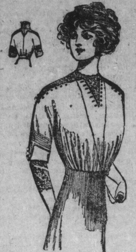
FANCY PEASANT BLOUSE.

This Adjunct of the Toilet Completes a Charming Hat Effect. Of course she wears a veil if she wishes to be in the fashion and also if she likes to keep her well curled head in trim, orderly style. Black and white lace veils which hang straight from the brim of the hat are very smart fringed. They add a bit of charm to a charming hat or