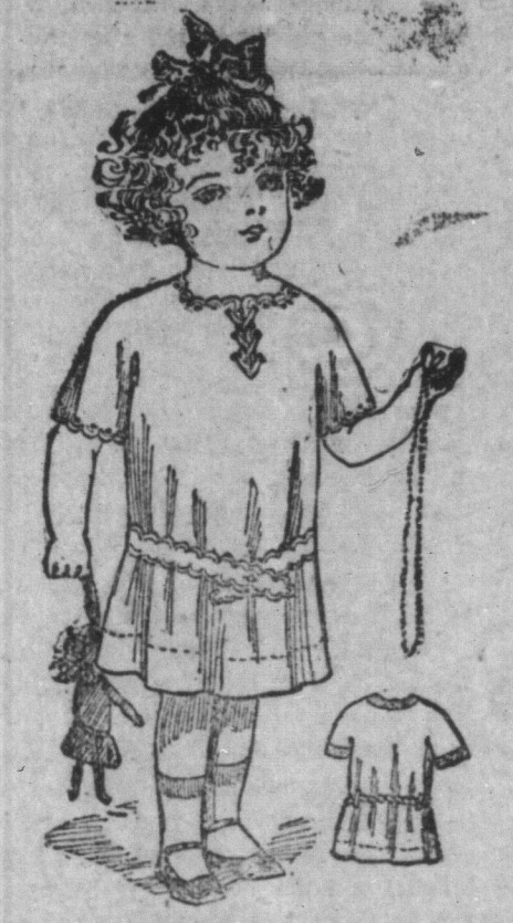
CHILD'S ONE PIECE DRESS.

A scrap of real lace these days is worth twice its weight in gold, for