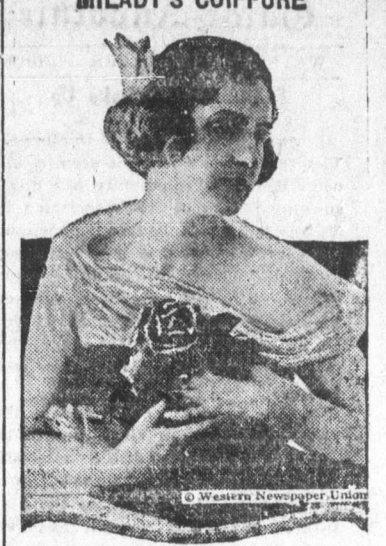
A charming effect in wor, on's hairstructed comb, somewhat resembling