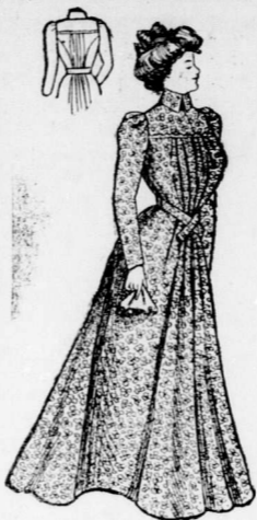
See East and West Windows Thursday and Friday.

Single fare on railways on certificate plan.