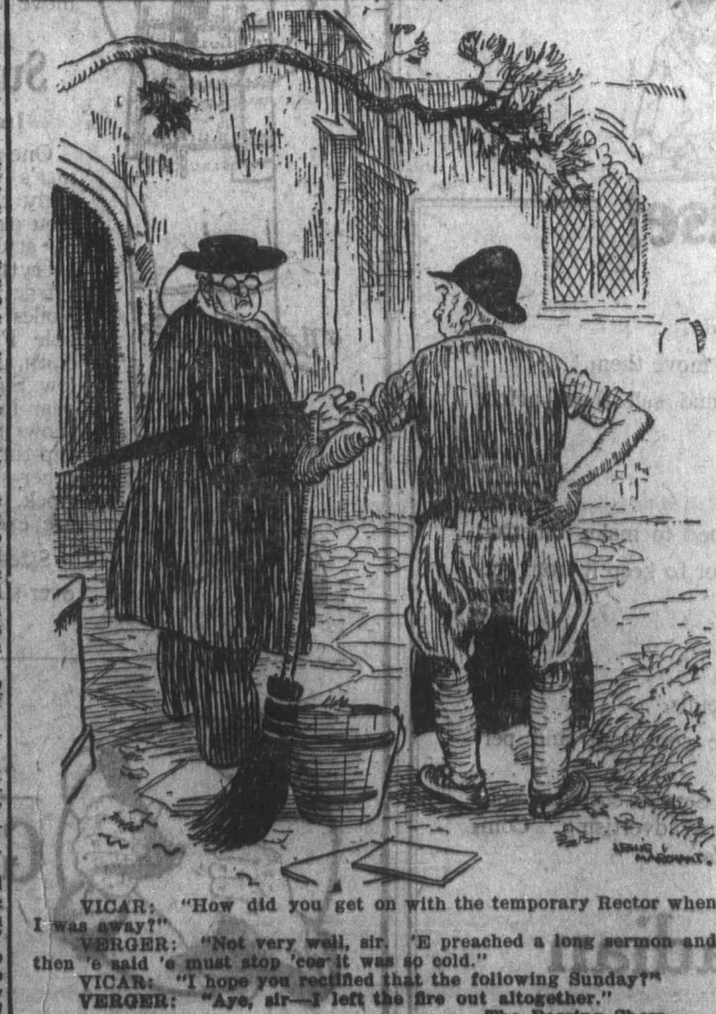
VICAR: "How did you get on with the temporary Rector when I was away?"

CHAPTER XV. "Put up Your Hands!" Angus had not told Piccolo all that was in his mind. He thought it better not to. He was inclined to be reticent in matters affecting his feelings. He was hurt regarding Movie Bill, more hurt than angered. Bill's dereliction was the theme on which he mused, on which he was "thinking underneath."