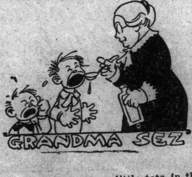
I suppose the poor little tots in the torrid zone hev tew hang their stockings on the ice chest.

8 ONLY MORE SHOPPING DAYS BEFORE CHRISTMAS