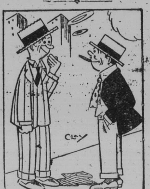
"Well, I suppose you're still boss in

My Button Pins. I never have to hant buttons now. All my old hat pins have been pressed into service, each carrying buttons of one vraiety securely held in place back to the tribe after two days and nights of constant traveling. They were footsore, wet to the hore. My Button Pins. I never have to hant buttons now. All my old hat pins have been pressed into service, each carrying buttons of one vraiety securely held in place by a cork on the point of the pin. The button pins, as I call them, are laid in one long row in a flat box so I can see at a glance just what I want— 1% yards lining for the bodice. Price 20 cents each. Many styles of smart apparel may be found in our Fashion Book. Our designers originate their patterns in the heart of the style centres, and their creations are those of tested popularity, brought within the means of the average woman. Price of the book 10 cents the copy.