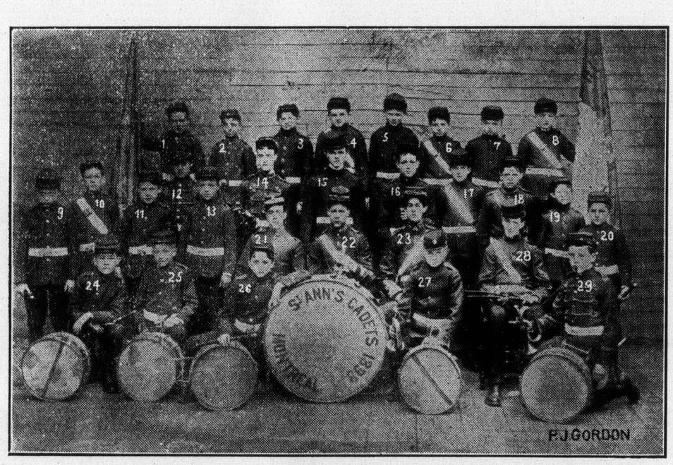
ST. ANN'S CADETS-MONTREAL-FIFE AND DRUM BAND.