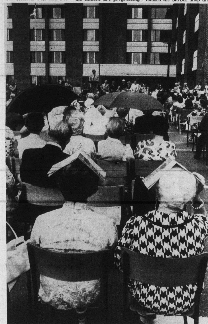
Blessed with a few hours of blazing sunshine Friday, spectators listen to Premier William Davis' address at the official opening of Sheridan Villa Home for the Aged on Truscott Drive.

"I no wonder that one of Sheridan Villa's residents says: 'Gone are our horrible institutions of the past and thank goodness, since now we are all approaching extended longevity and will be grateful to learn that we might be destined to an institution-type residence. Our regularly scheduled programs that are available will be a constant source of stimulus and activity to help realize that although we are no longer able to look after ourselves we are nevertheless a part of the community in which we live.'"