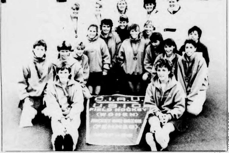
VIKETTES HAVE BANNER YEAR: The Victoria Vikettes captured the CIAU field hockey championship last weekend at Lamport Stadium. Taking the silver was U of T, the bronze went to Dinnies of Calgary.