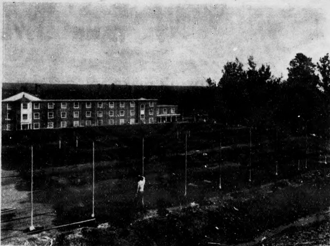
The newly constructed tennis courts beside Lady Dunn Hall should be ready for their first matches soon. The courts were to have been ready for summer school, but work has been held up until now.