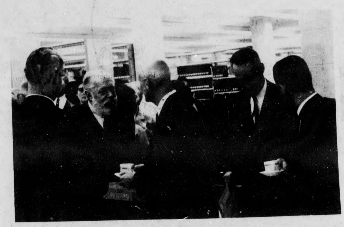
Guests gather for tea in the Library.