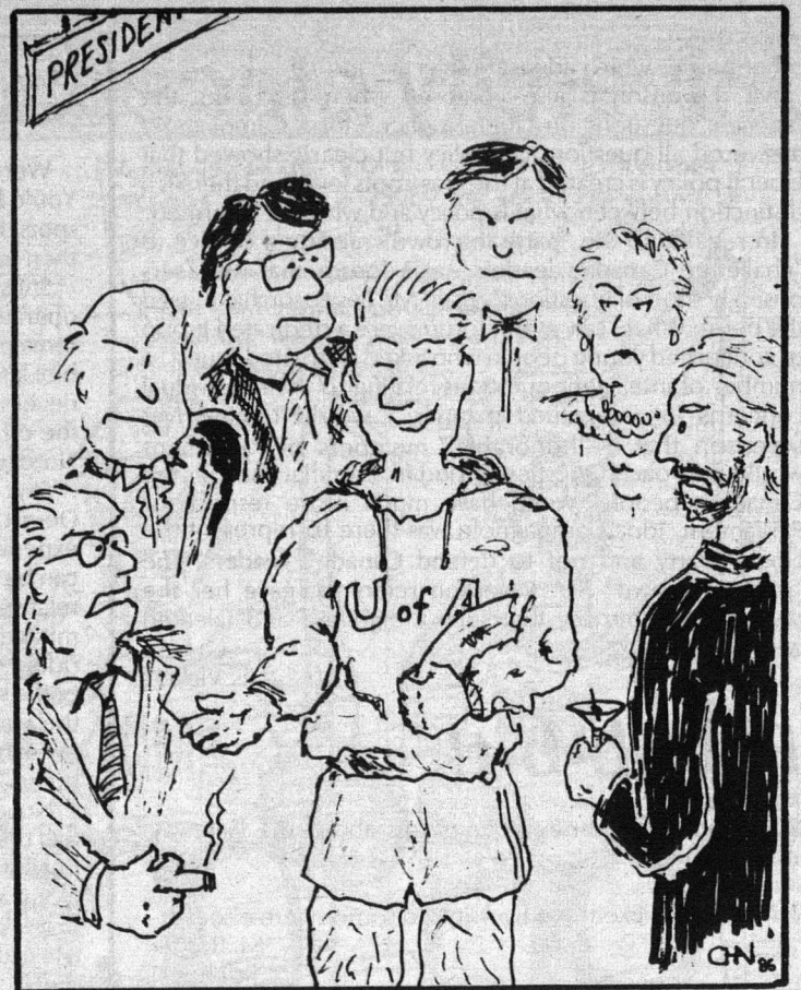
"So ... when does the party start?"

According to the Development Office which is in charge of the President's Club, the next function is a dinner to be held on Oct. 23 at the Four Seasons. They said that "we consider this to be the highlight of the year for the President's Club."