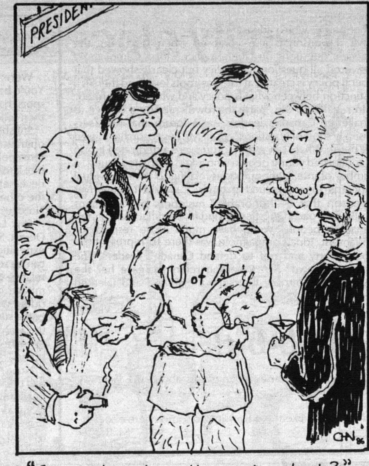
"So ... when does the party start?"

According to the Development Office which is in charge of the President's Club, the next function is a dinner to be held on Oct. 23 at the Four Seasons. They said that "we consider this to be the highlight of the year for the President's