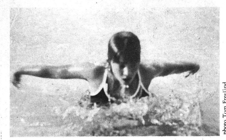
Opening swim meet goes this Saturday.

The pool will get its first taste of competition this Saturday. The Golden Bears, in conjunction with Speedo, are hosting the