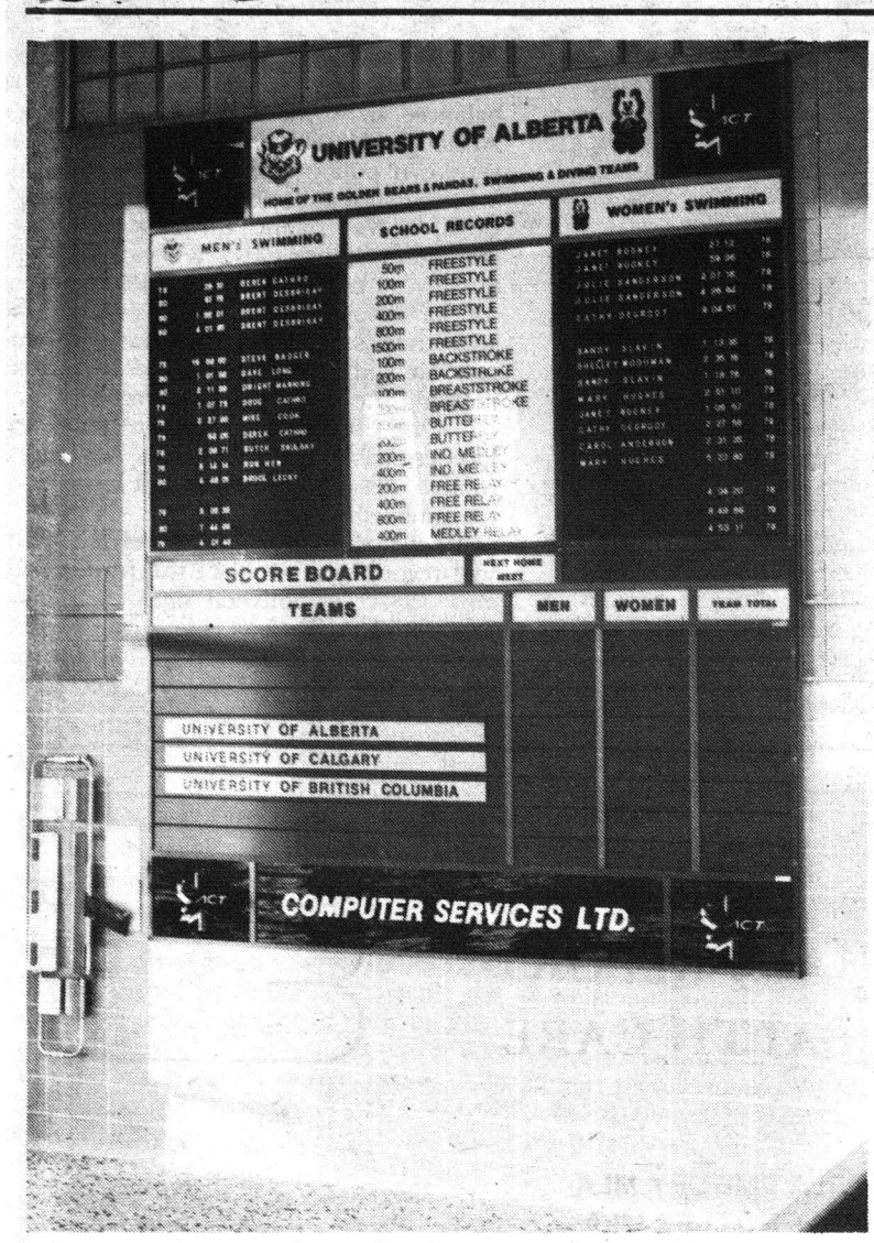
New scoreboard is one of the new features at the recently renovated West Pool.