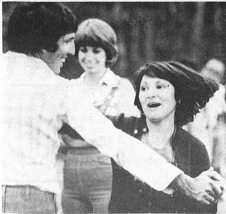
The Edmonton Folk Arts Festival brought dancing, singing, crafts, lore and exotic foods to the woods of August at Kinsmen Park West, in the river valley.

The photographs will remain in exhibition until September 30th.