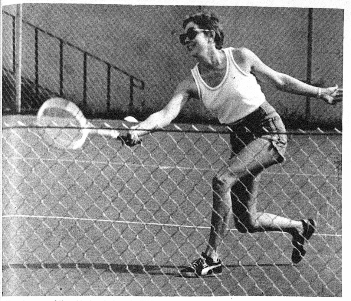
Tennis anyone? If you'd take a look on the SUB courts today, chances are pretty good you'd find one not