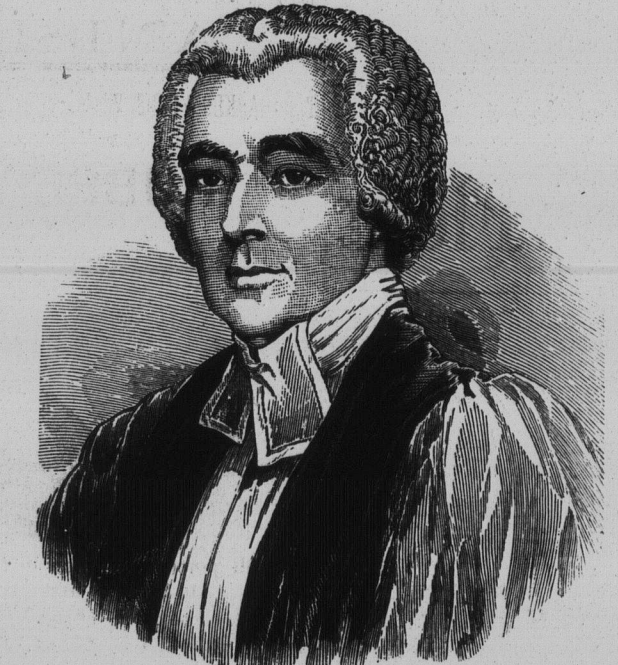
CHARLES INGLIS, D. D.

The following year it was voted that the church be built square with a Venetian window at the end. In September 1813 was