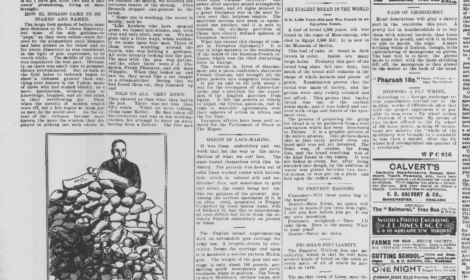
A MILLION AND A HALF IN GOLD-DUST.