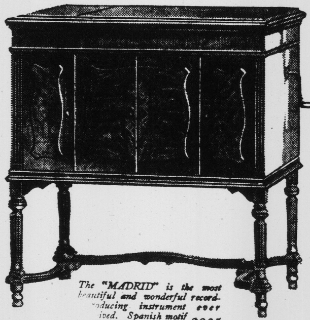
The "MADRID" is the most beautiful and wonderful record. It is a Spanish motif. In Walnut... $235