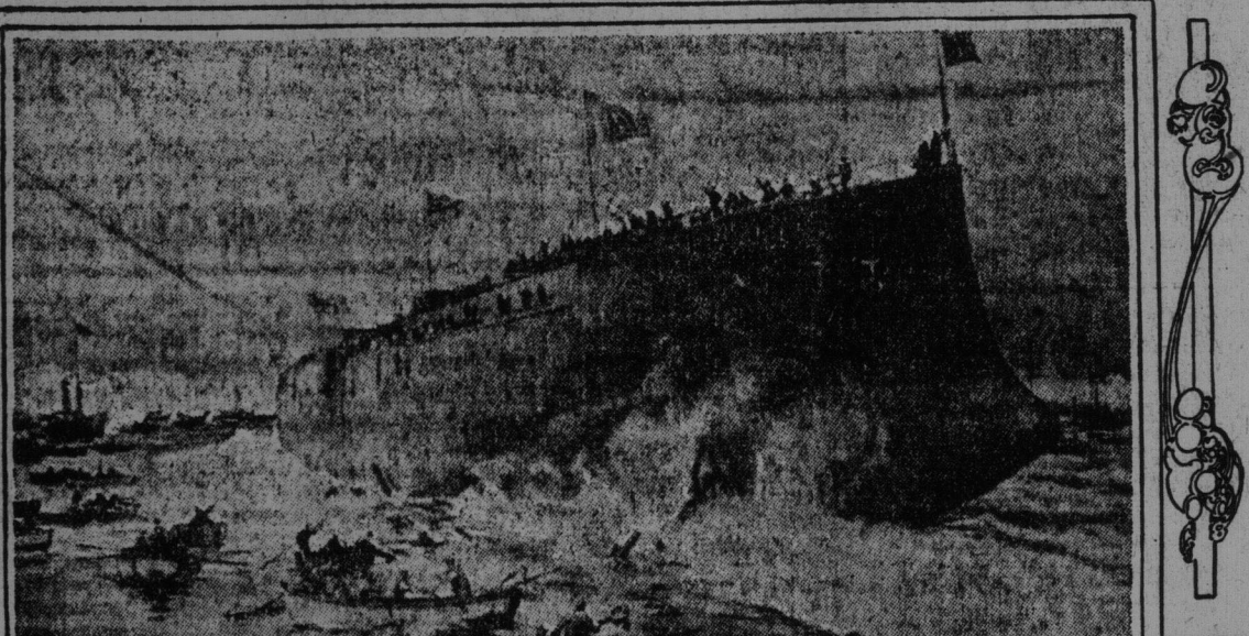
The Dreadnought Taking the Water From the Sphere

The battleship Dreadnought, according to the Naval and Military Review of Plymouth (Eng.), marks an important advance on any war ship afloat. It is curious to note that in some respects she recalls her namesake, launched in 1875, since both are remarkable as having the special characteristics of carrying an armament composed entirely of guns of the largest calibre, and a cruising heavier and more extensive than any of their respective predecessors.